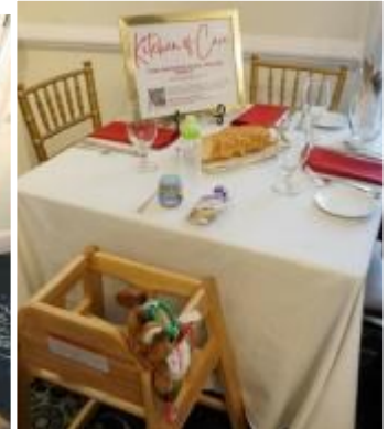
Left: Future Living Room of Fellowship Right: Future kitchen of Care