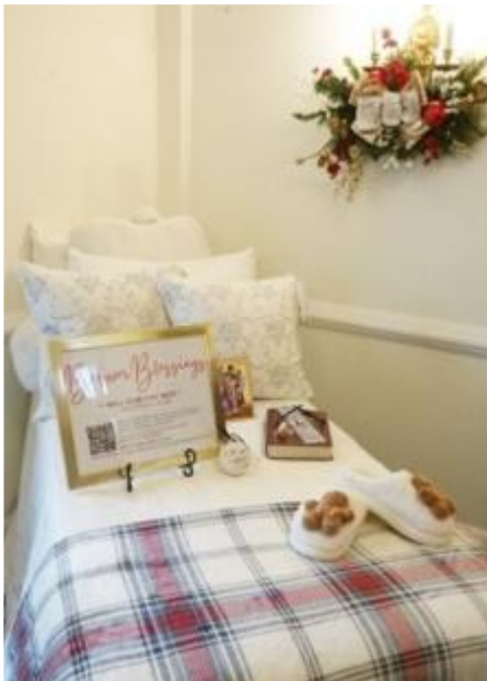
Future Bedroom of Blessing