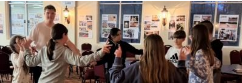
Team building at a February GOYA.