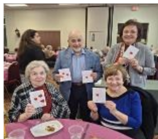
Thank you for our beautiful Valentine's Day cards from our artistic St. Sophia School students