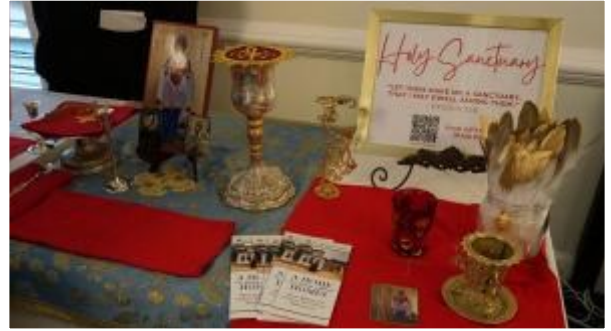
Representation of the future Holy Sanctuary at St. Hermione Home

St. Hermione Home (SHH) is a Christ-centered ministry offering hope and healing to homeless, pregnant women who have chosen life for their child. SHH provides a safe haven where mothers receive housing, education, counseling and life-skills training to build stability, embrace self-sufficiency and create a brighter future for their families. The home has 6 bedrooms, 3 part-time staff, pre-natal care, daily spiritual services and mental health support.