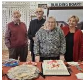
Members with February birthdays

Sending heartfelt wishes and blessings to all!