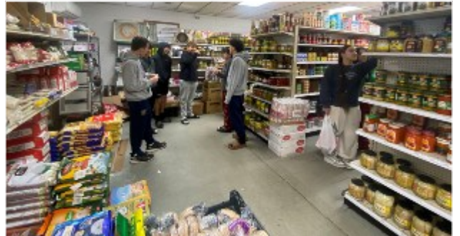
An enjoyable pitstop on the way back from WYR at a Middle Eastern market