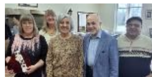
Door Prize Winners