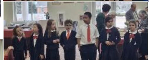
The St. Sophia School serenaded us with love songs for Valentine's Day.